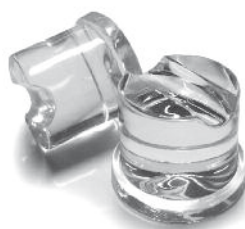
B 9040 AS / WS

Also available in the self-contained range for "Bistrot" cube: B 2006, B 2508, B 3008, B 3015, B 4015, B5022, B 6022, B 7540, B 9550 See pertaining literature for more details