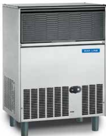
B 9040 AS/WS

Bar Line Equipment range is the newly released EU made ice makers for Thimble-shaped rounded ice cubes coming from Bar Line.